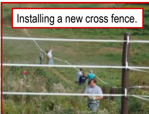
Installing a new cross fence.