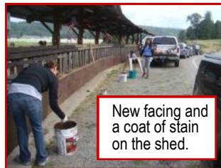
New facing and a coat of stain on the shed.