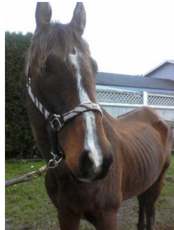
Kal on his first day with Cowgirl Spirit.

When a horse is severely emaciated, as Kal is, it is important to bring them up to proper weight slowly, and under the direct supervision of a veterinarian. While a person's first reaction may be — "GIVE HIM FOOD!" it is vitally important reintroduce food very slowly, with several meals of a small amount of grass hay per day. Offering an emaciated horse too much food too soon can cause him to be overwhelmed, putting undue stress on his body, which can cause his system to shut down. Over the past four weeks, Kal has been slowly having his daily food ration increased, and has been brought up to three regular feedings of grass hay, a vitamin supplement, and a grain-free, low-carb feed. Check out our Facebook page and http://ponybootcamp.blogspot.com/ for regular updates on Kal!