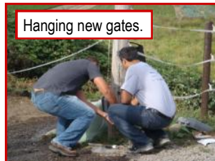
Hanging new gates.