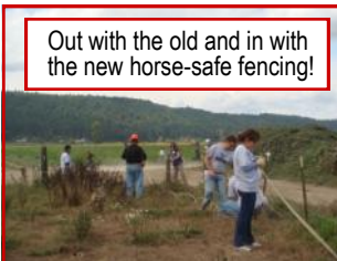
Out with the old and in with the new horse-safe fencing!