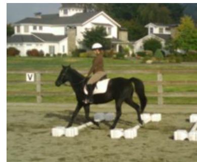
Christina and Cheyenne practice trot poles at River Run Ranch.

A recent clinic focused on conformational and behavioral assessment. Since the nature of our mission requires us to sometimes make quick decisions on horses to take in to our program, this particular skill set is vital to the success of our organization. The material included an overview of general physical assessment, including the Hennecke Body Scoring System, a review of common conformational issues, and the impact of these issues regarding rehabilitation times and possible impacts in regard to natural aptitudes of each horse. For example, while one body type may naturally help a horse excel at Dressage, they may not be built to excel in the Hunter/Jumper arena, and vice-versa. This insight allows us to focus each rescue’s training on a discipline where they can succeed, which ultimately will result in a happy, fulfilled horse, and a life-long match with their new adoptive owner.