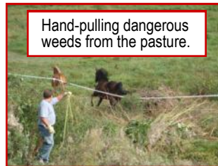
Hand-pulling dangerous weeds from the pasture.