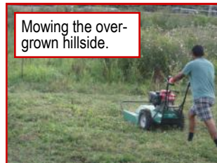
Mowing the overgrown hillside.